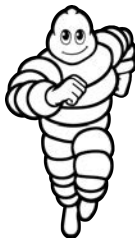
Michelin Corporate Logo - Solid blue and yellow background and white logo/Michelin Man are required